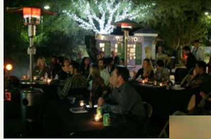
Great Food and Great Company

strategy for climbing access and promoted the idea of Designated Climbing Resources and a Western Climbing Festival! ACSD Merchandise like t-shirts, beanies, ACSD 2010 Calendars highlighting local crags and the much awaited ACSD Pocket Guide were available for an eager crowd. The guidebook which includes 3 of San Diego's backcountry crags was an instant hit with never before published route beta! Don't miss next year's celebration!