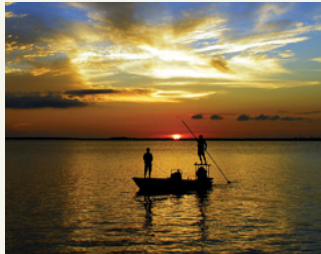
"Drift: Bahamas" – One of many films to be shown

Telluride's MOUNTAINFILM Festival is coming to the San Diego Natural History Museum. The exhilarating and provocative films highlight the world we live in with adventure sports, culture, and remarkable people.